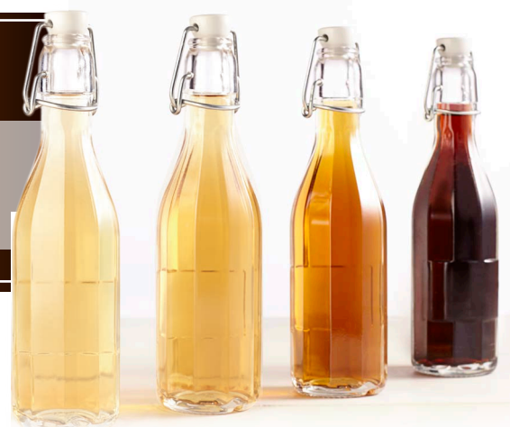
Herbarom colour spectrum® golden-yellow to dark brown

We are happy to advise you on individual products!