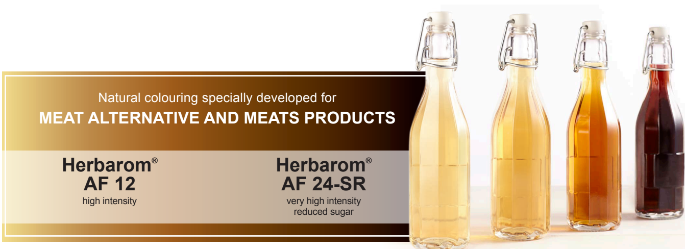
Herbarom® colour spectrum golden-yellow to dark brown